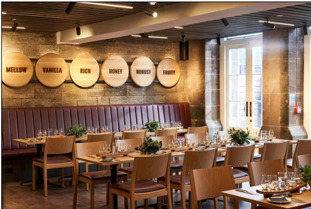
Whisky Bond 1

The Whisky Bonds are located on level -2. There is lift access to this level.