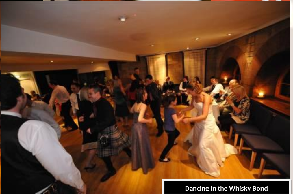
Dancing in the Whisky Bond

Tel: 0131 220 0441 weddings@scotchwhiskyexperience.co.uk www.scotchwhiskyexperience.co.uk