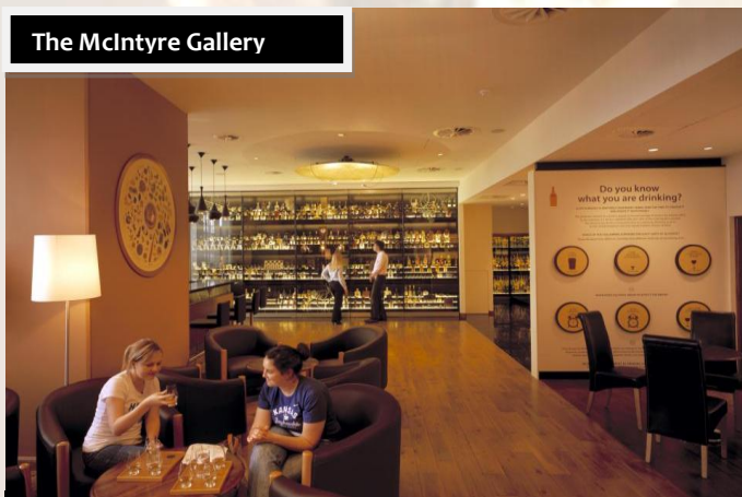
The McIntyre Gallery