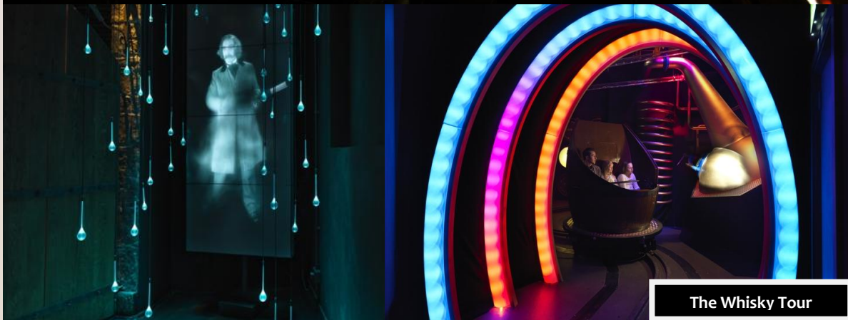
The Whisky Tour