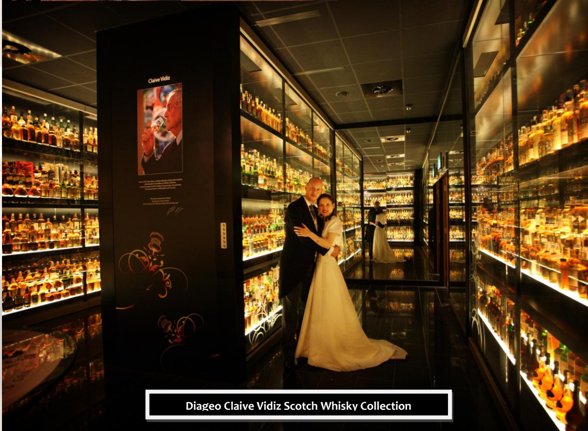
Diageo Claive Vidiz Scotch Whisky Collection