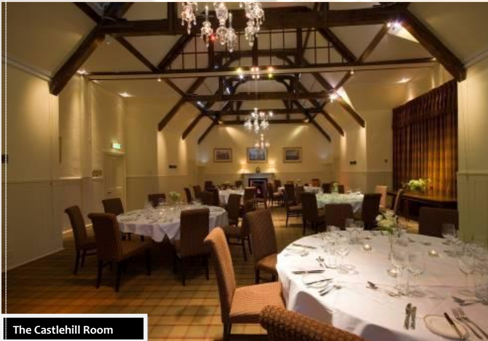
The Castlehill Room